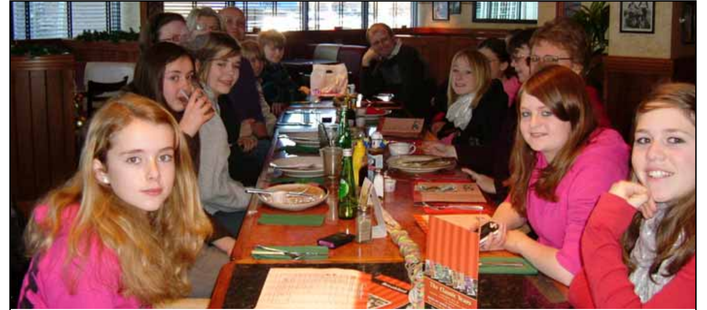
Members of Salt and Pepper decided to treat themselves to brunch at Frankie and Benny's in Redhill for their Christmas treat. Here they are, above and below, expectantly awaiting their food!